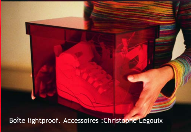
Boîte lightproof. Accessoires : Christophe Legoux