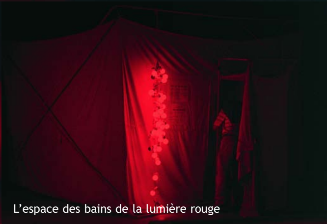
L'espace des bains de la lumière rouge