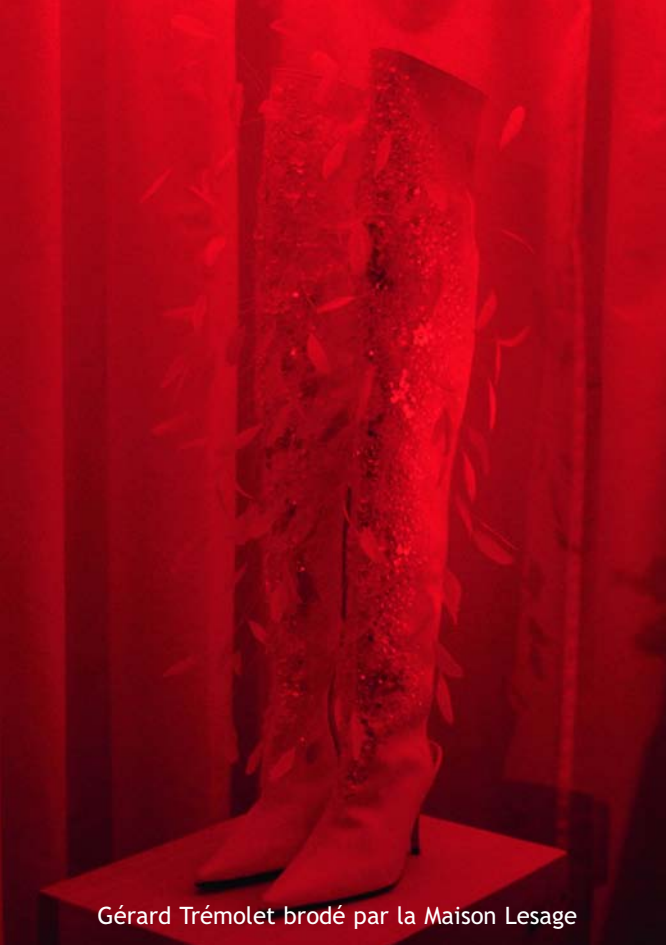
Gérard Trémolet brodé par la Maison Lesage